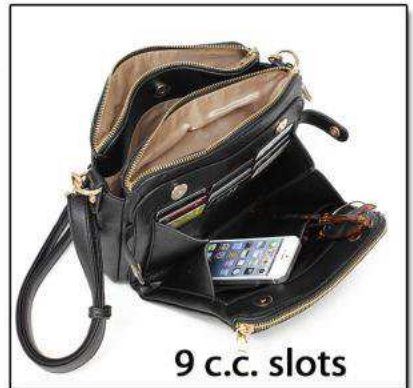
9 c.c. slots