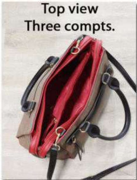
Top view Three compts.