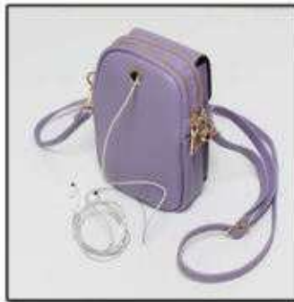
Credit Card Holder inside