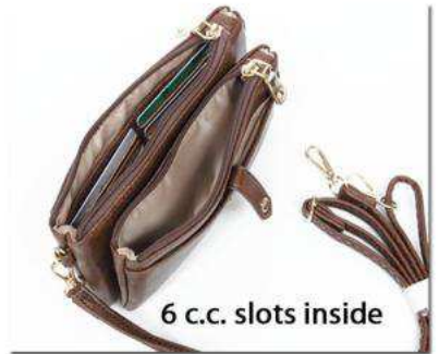
6 c.c. slots inside

Backside touch screen cellphone pocket. It can fit any large cellphone.